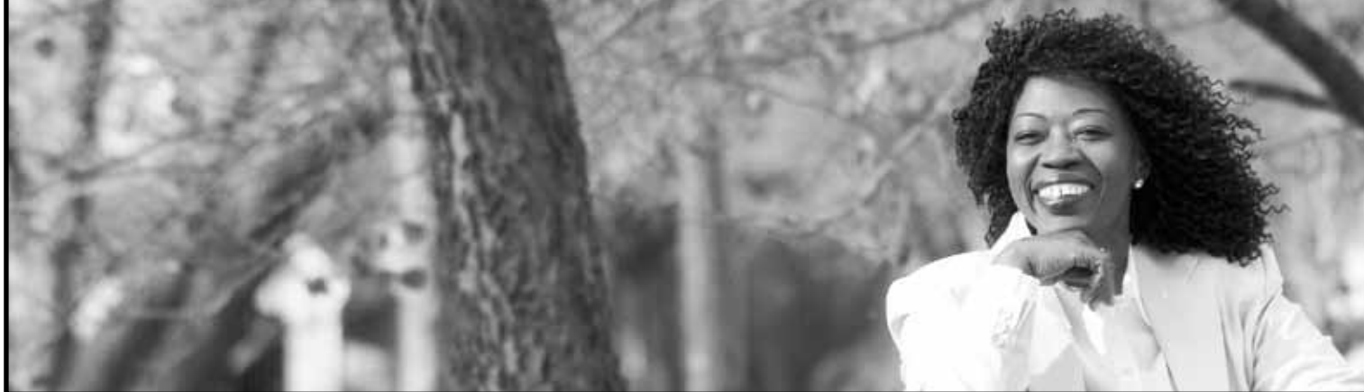
In 2012 "Prayer Changes Things" - Take your prayer request on-line: AdventureVictory.com; EJSCOTTMinistries.com

issuu.com/phalconstarnews PhalconStar.com Proud Sponsor THAT CELEBRITY INTERVIEW