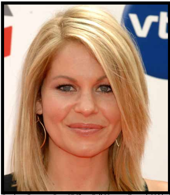
Candace Cameron-Bure "DJ" on Full House talks with Valder